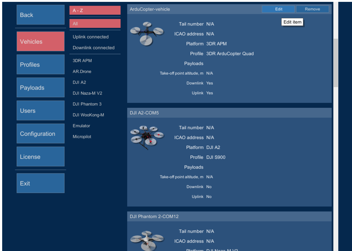
Figure 1: New Ardupilot vehicle

Vehicle profile needs to be assigned to allow mission planning with this vehicle. Vehicle avatar should be assigned in vehicle profile to properly see the vehicle location on map.